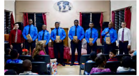
First Responder Night